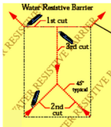
Figure 1. Modified I cut

All rough openings for windows and doors shall be flashed in the following manner. An approved water-resistive barrier shall first be installed on the wall, covering the rough opening. The water resistive barrier (WRB) over the rough opening shall then be cut in the “modified I” or “standard I” fashion, and the side and bottom flaps formed by the cut shall be folded into the rough opening, and secured so that they remain visible on the interior side of the framing until the rough framing inspection has been approved. The water-resistive barrier (WRB) flaps shall remain visible on the interior side of the framing until the rough framing inspection has been approved.